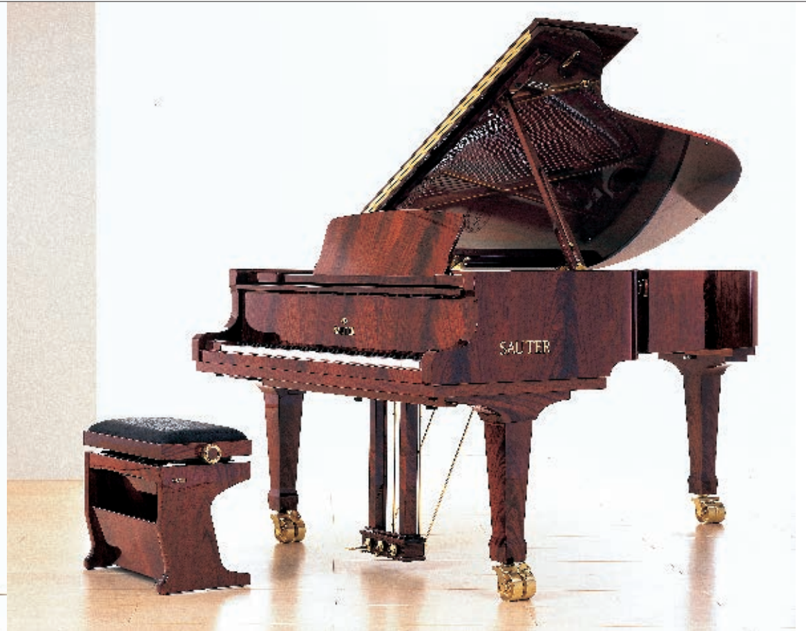
polished pyramid mahogany