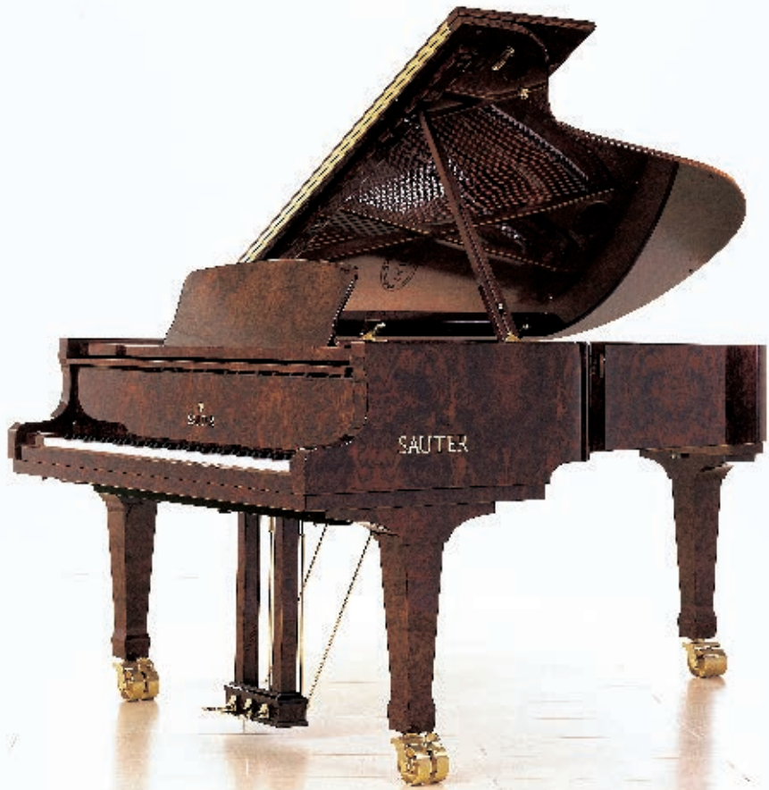
polished burl walnut